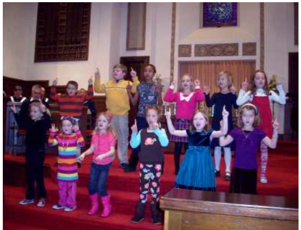
BIG HOUSE song and motion by the Children's Choir last Sunday

1 Try-It Camp is a taste of camp for parents and younger campers. One adult may bring up to three children. Lodging is in cabins or hotel-style rooms.