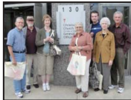
Disciples Heritage Tour folk are pictured in front of the General Office of the Christian Church (DOC) in Indianapolis, IN.

and Welles' own life. Upon its release, Hearst prohibited mention of the film in any of his newspapers. The film traces the life and career of Charles Foster Kane, a man whose career in the publishing world is born of idealistic social service, but gradually evolves into a ruthless pursuit of power. Narrated principally through flashbacks, the story is revealed through the research of a newspaper reporter seeking to solve the mystery of the newspaper magnate's dying word: "Rosebud."