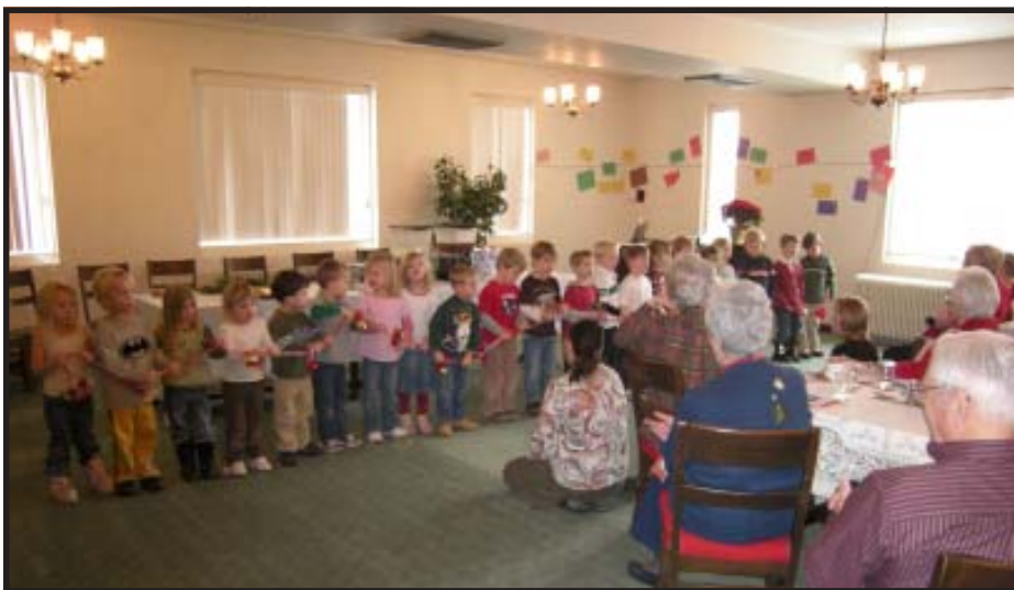
The Mother's Day Out children sing Christmas songs for the STARS Christmas luncheon.