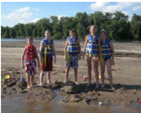
A last glimpse of summer... Chi-Rho mission trippers on a sandbar in the middle of the great Mississippi!