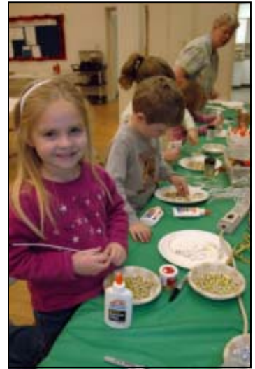
CAFÉ Christmas Making