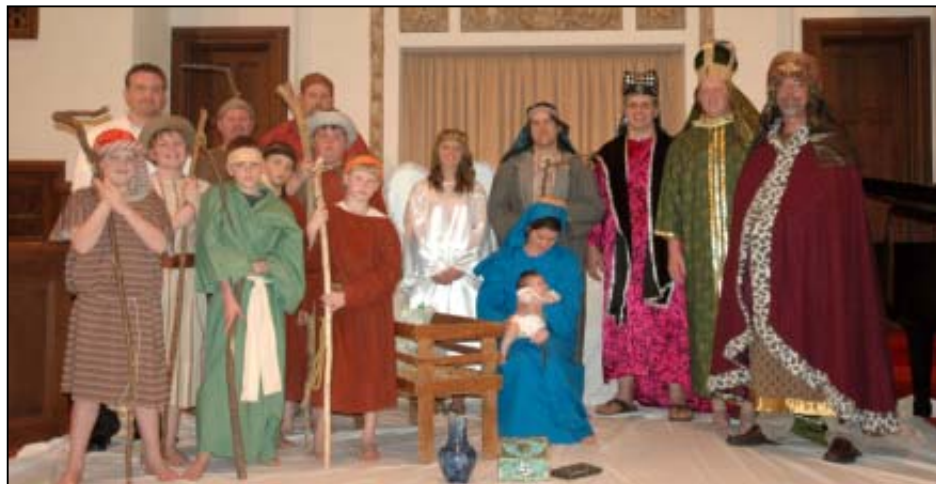
Above three: 76th Annual Christmas Pageant