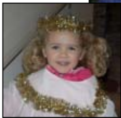
Above three: Living Nativity