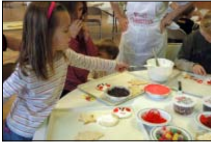
Care Package Christmas Cookie Decorating