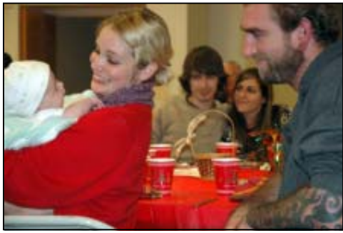
Christmas Fellowship Dinner