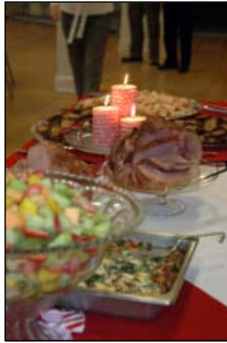
Women's Christmas Brunch