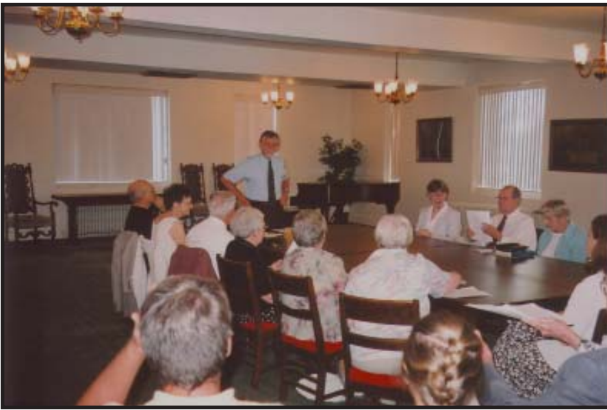
The Bible as Literature Sunday School Class