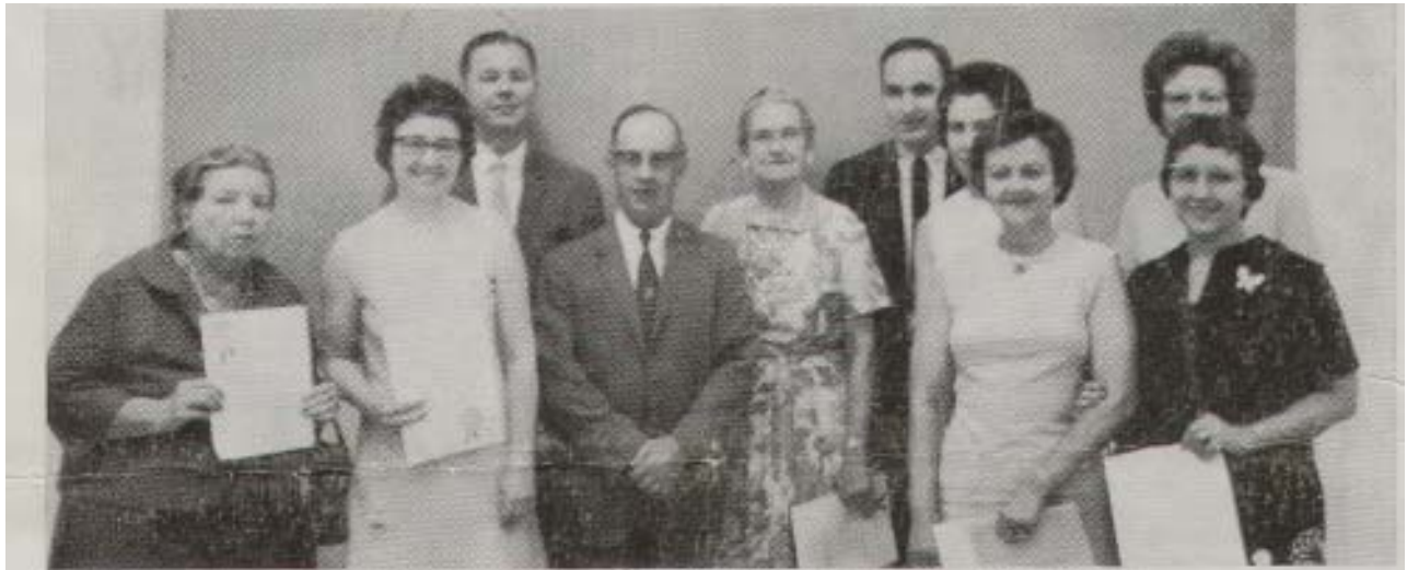
Recognition of Sunday School teachers who have taught church school for 8 - 14 years. June 1970